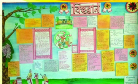
Wall Magazine of D.El.Ed. 1st Semester