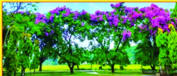
Beautiful Green Campus of DIET, Darrang