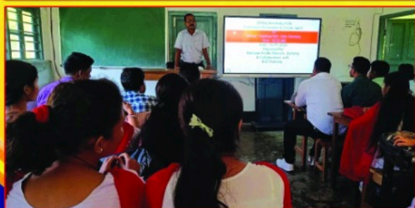
Newly renovated conference hall & Classrooms with ICT facilities