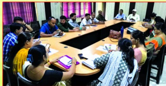
A Photo of Monthly Academic Meeting