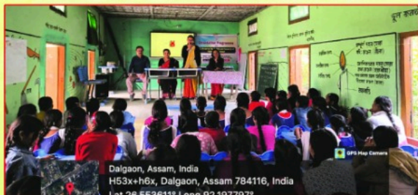
Dalgaon, Assam, India H53x+h6x, Dalgaon, Assam 784116, India Lat 26.553611° Long 92.197797°