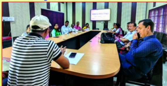
A photo of monthly DACG Meeting