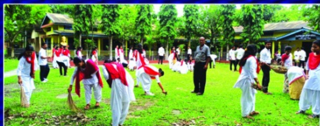
Pre-Assembly Cleanliness work by trainees