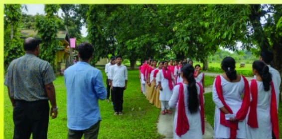
Photo of Daily Morning Assembly in the campus conducted by the trainees of DIET Darrang

As per the MoU between DIET Darrang and PDUAM Dalgaoon 10 D. El. Ed. Trainees from each semester along with two guide faculties participated in the two-day national Seminar on 'The Influence of AI in Shaping Political Behaviour of Citizens' on 10th and 11th February, 2025